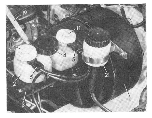
2 Brake fluid reservoir 21 Clutch fluid reservoir

Caution! Brake fluid is corrosive. Do not bring into contact with paintwork.